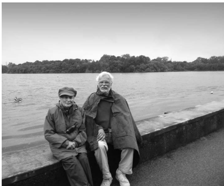
Above and below Aldenham Country Park